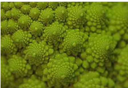
Figure 2. Natural fractals: are natural objects that can be represented with a very good approximation by mathematical fractals with statistical self-similarity. Fractals found in nature differ from mathematical fractals in that natural ones are approximate or statistical and their self-similarity extends only to a range of scales (for example, at a scale close to the atomic its structure differs from the macroscopic structure). Available at: https://www.google.es/search?q=natural+fractals+images&tbm=isch&ved=2ahUKEwinivWw94ztAhUCO1MKHQGoCkIQ2-cCegQIABAA&oeq=Natural+fractals&gs_lcp=CgNpbWcQARgBMgIIADIECAAQHjIECAAQHjIGCAAQBRAeMgYIABAIEB46BAgAEBM6CagAEAcQHhATOGYIABAEaEBM6CagAEAUQHhATOGYIABBDOgUIABCxAzoECAAQA1DKihRYvLwUYNPjFGgAcAB4AYABvAOIAcQUkgEJMC43LjAuMi4ymAEAoAEBqgELZ3dzLXdpei1pbWewAQDAAQE&scient=img&ei=C4SIX-fYMYL2zAKB0KqQBA

This does not mean that the study and development of fractal mathematics is independent of material reality, on the contrary, its birth as a theory in the second half of the 20th century had as its fundamental objective, to model, describe and analyze many natural phenomena and scientific experiments that Euclidean or classical mathematics could neither represent nor answer.